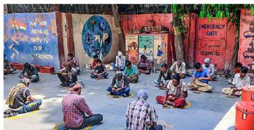
COVID-19 Doesn't Scare Them as Much as Starving